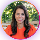
SUMBUL DESAI VP, HEALTH APPLE