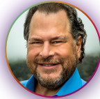
MARC BENIOFF FOUNDER & CEO SALESFORCE