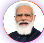
NARENDRA MODI PRIME MINISTER OF INDIA