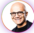
SATYA NADELLA CHAIRMAN & CEO MICROSOFT