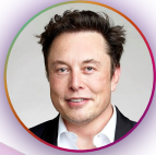
ELON MUSK CEO TESLA, SPACE X, TWITTER