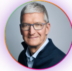
TIM COOK CEO APPLE