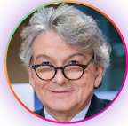
THIERRY BRETON EUROPEAN COMMISSION