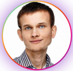
VITALIK BUTERIN FOUNDER ETHEREUM