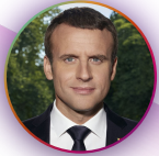
EMMANUEL MACRON FRENCH PRESIDENT