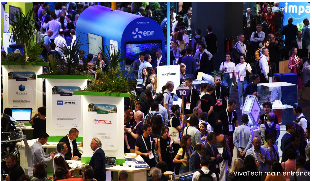
VivaTech main entrance