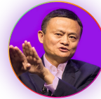
JACK MA FOUNDER ALIBABA