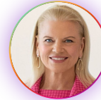
GINNI ROMETTY FORMER CHAIRMAN & CEO IBM