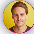
EVAN SPIEGEL CO-FOUNDER & CEO SNAP INC.