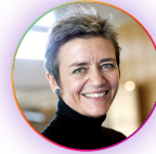
MARGRETHE VESTAGER EUROPEAN COMMISSION