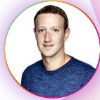
MARK ZUCKERBERG FOUNDER META